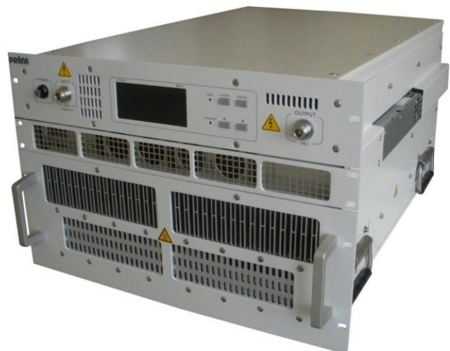
Prana DT 150 power amplifier