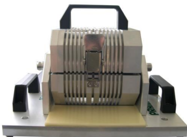
Prana IP-DR250 clamp + CJ-DR250 JIG